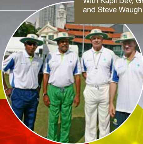
With Kapil Dev, Greg Chappell and Steve Waugh