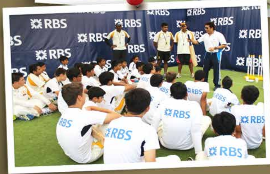
RBS Sponsored Batting Junior Masterclass with Sachin Tendulkar