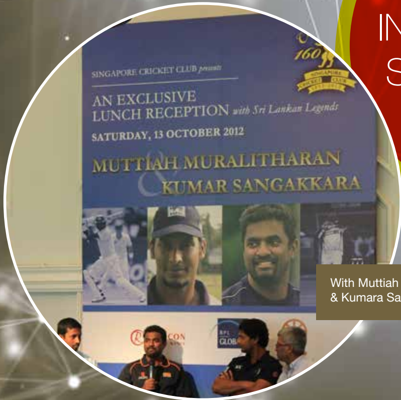
With Muttiah Muralitharan & Kumara Sangakkara