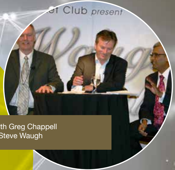
With Greg Chappell & Steve Waugh