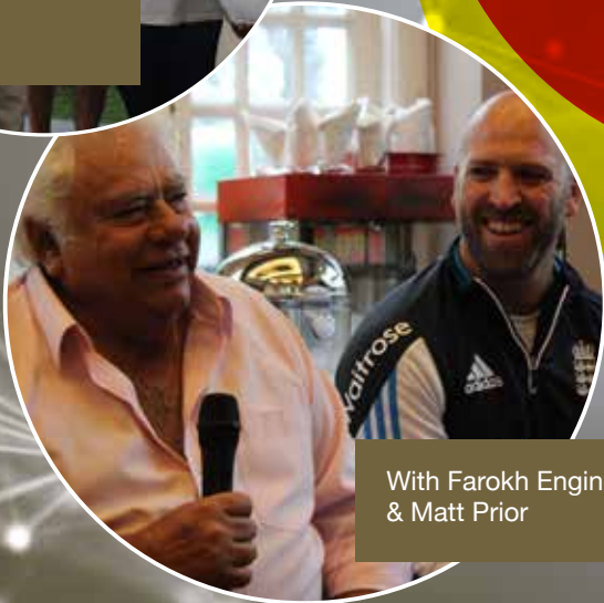
With Farokh Engineer & Matt Prior