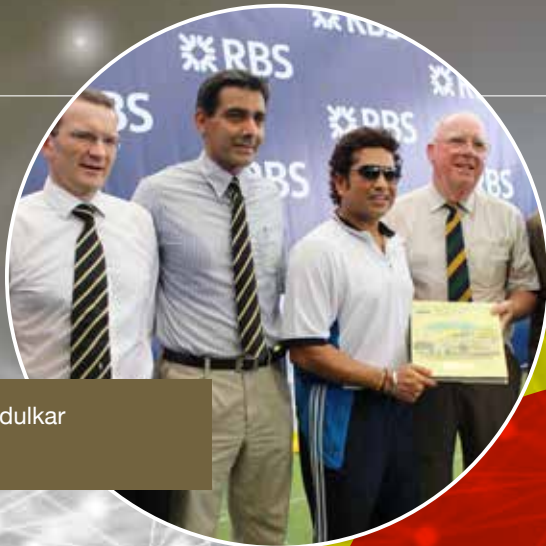
With Sachin Tendulkar