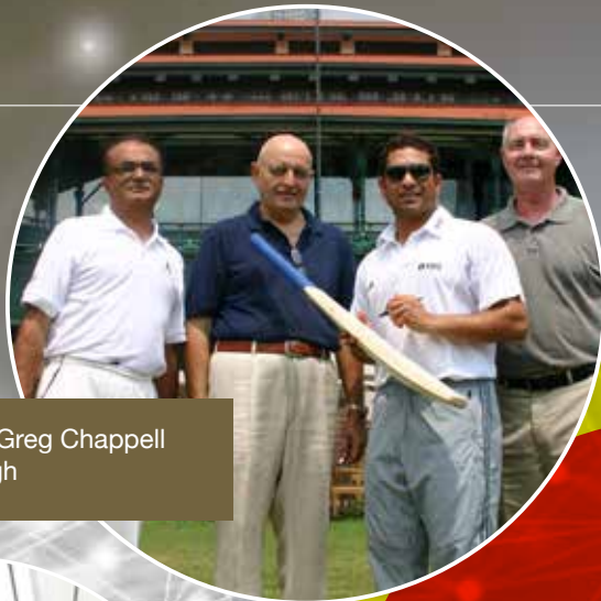
With Kapil Dev, Greg Chappell and Steve Waugh