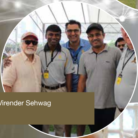
With Virender Sehwag