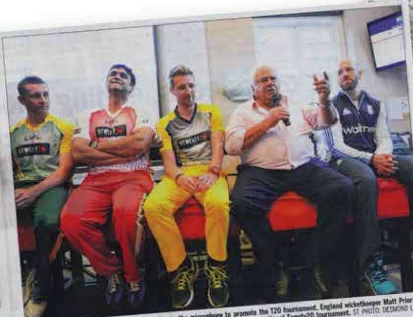
Former India wicketkeeper Farokh Engineer taking to the microphone to promote the T20 tournament. England wicketkeeper Matt Prior is on his left, along with captains of three teams in the Singapore Cricket Club International Twenty20 tournament.