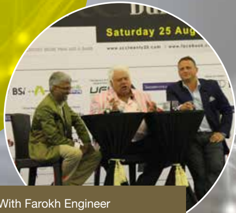
With Farokh Engineer and Darren Gough