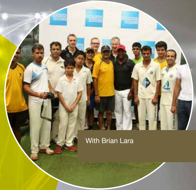
With Brian Lara