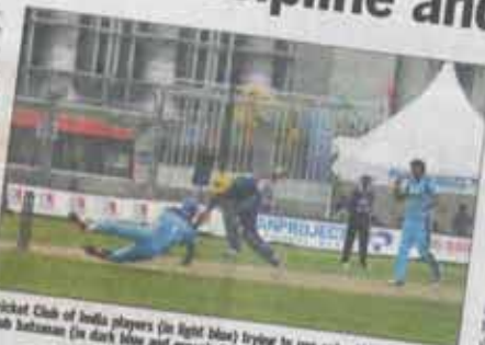
Cricket Club of India players (in light blue) trying to run out a Madras Cricket Club batsman (in dark blue and green).

The Singapore side were in the heat when the tournament's best batsman Anish Param (27) and Ka-